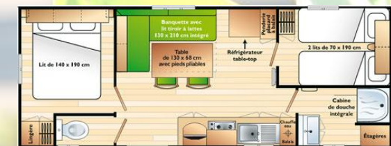
No contractual plan

For maximum comfort, these mobil-homes are electric heating, allowing you to enjoy fully your stay on any season.