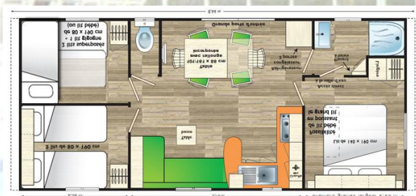
No contractual plan

For maximum comfort, these mobil-homes are electric heating, allowing you to enjoy fully your stay on any season.